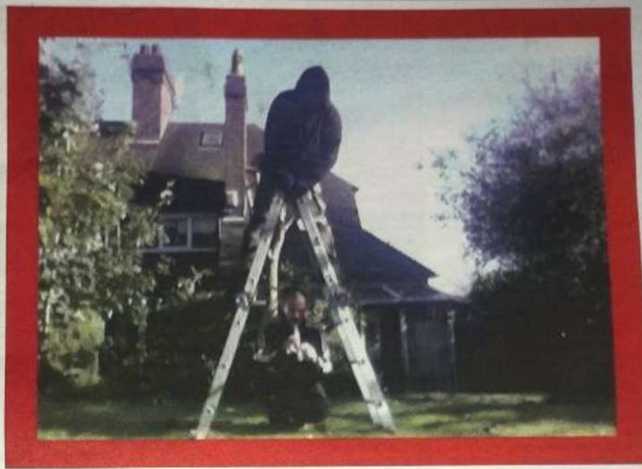
Dan Szoar, Adapting to Change / Broken Boy(ler) 2012–2014 (still), 2014.

The biggest feat of Fake Barn Country , an uncompromising compilation of incongruous works, perhaps lies in its rupturing of the visitor's expectation – of function, appearance and sequence. Despite its heterogeneity, the show never feels out of step; instead, it continuously challenges viewers' assumptions. We are never quite sure which unfamiliar object will appear next around the corner. ➤